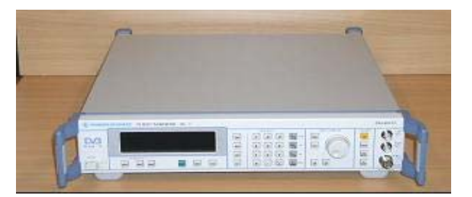
Fig. 1. Measuring test transmitter SFL-T (Rohde-Schwarz).

MSK 33 (Kathrein) measuring receiver and analyzer for the reception and measurement of parameters of analogue and digital signals of all standards (DVB-S, DVB-C, DVB-T), inclusive of the MPEG-2 decoder and color monitor (Fig. 2),