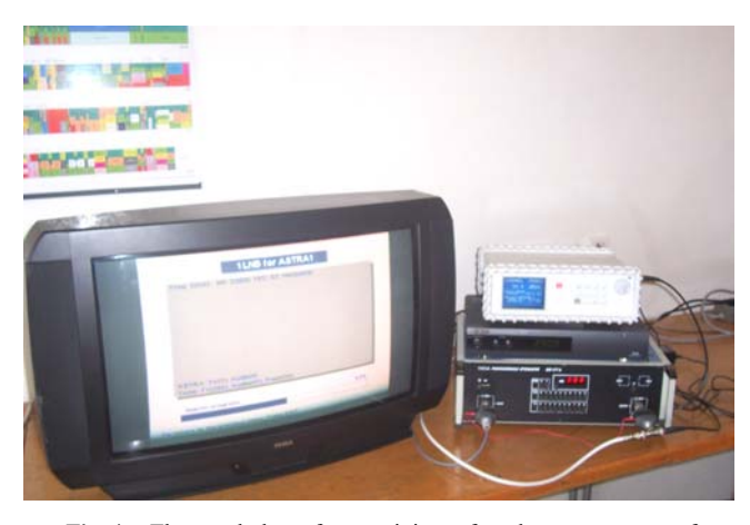
Fig. 4. The workplace for receiving of and measurement of digital signals of the DVB-S standard.