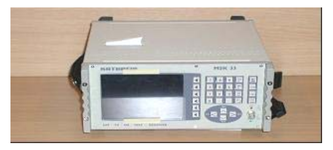
Fig. 2. Measuring receiver and analyzer MSK 33 (Kathrein).

MSK 33 (Kathrein) measuring receiver and analyzer for the reception and measurement of parameters of analogue and digital signals of all standards (DVB-S, DVB-C, DVB-T), inclusive of the MPEG-2 decoder and color monitor (Fig. 2),